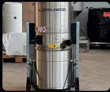
GX AISI 304 stainless steel bin and chamber