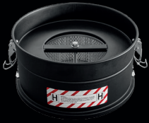
H14 ABSOLUTE FILTER Class EN 1822