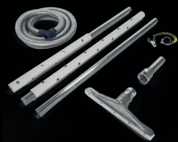
Oven cleaning kit (included)