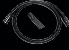
Starter Kit Ø 2 in