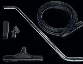
Dry Kit Ø 2 in