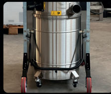
BX AISI 304 stainless steel bin