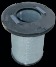
ACTIVE CARBON FILTER