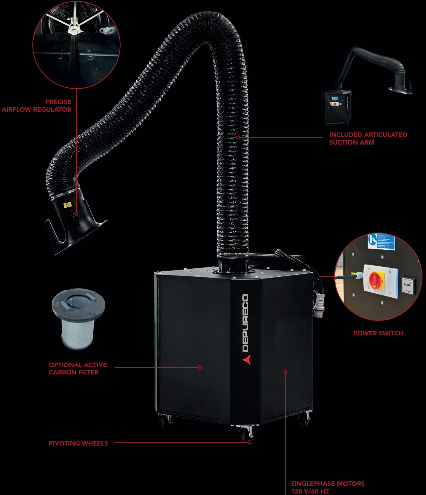
PRECISE AIRFLOW REGULATOR