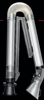
Stainless steel suction arm