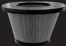
CONICAL POLYESTER Hepa 13