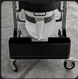
AB Accessory basket