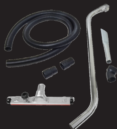
Wet & Dry Kit Ø 2 in