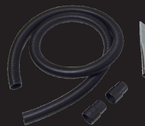
Starter Kit Ø 2 in