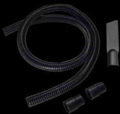
ANTISTATIC STARTER KIT Ø 1.96 in