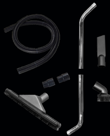
ANTISTATIC KIT PRO Ø 1.96 in