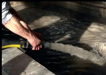
Suction and discharge simultaneously