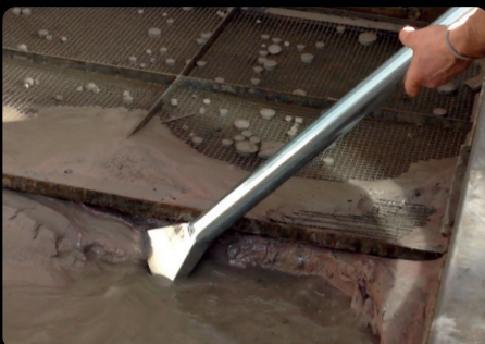
Effortless suction and sludge separation