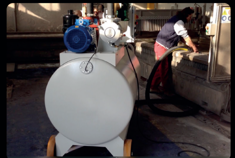
Efficient with heavy and difficult sludge