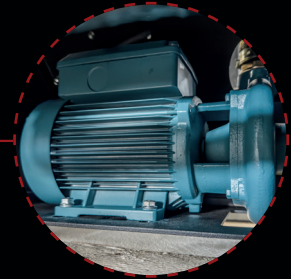
External discharge pump